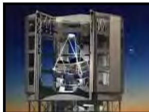
Model of Magellan Telescope